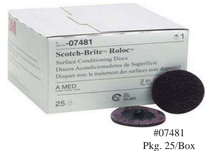
#07481 Pkg. 25/Box